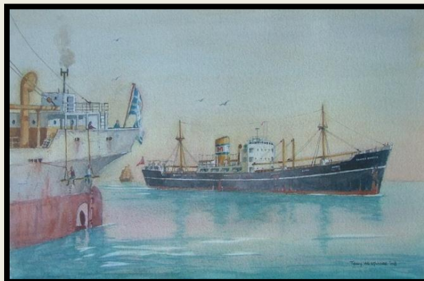
Manners Navigation – Hong Kong "Thames Breeze" in Singapore Roads circa 1960s