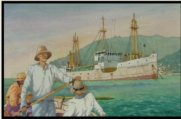
“Bintang Samudra 1V” at anchor off Batan Island circa 1960s