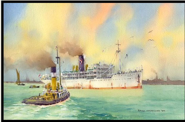
Booth Line "Hiliary" on the Mersey circa 1950s