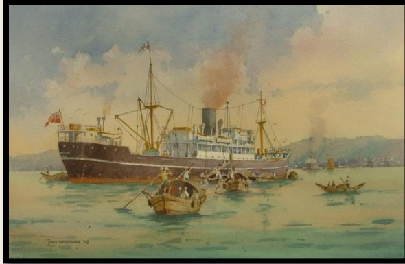
C.N.Co's "Fengtien" at the buoys in Hong Kong 1960s era