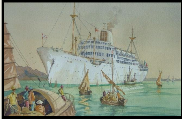
Messageries Maritime's "Laos" in Vietnam during 1960s