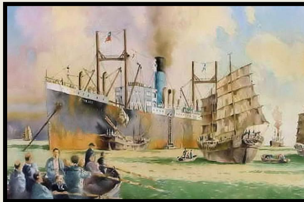
Blue Funnel Line "Achilles" at Shanghai circa 1930s