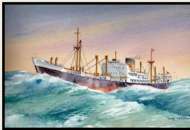
Bank Line's "Leverbank" in heavy weather circa 1960s