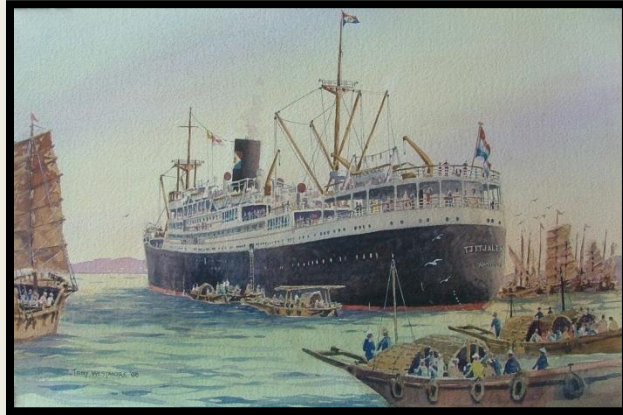
RIL Line's "Tjitjalenka" at Hong Kong circa 1960s