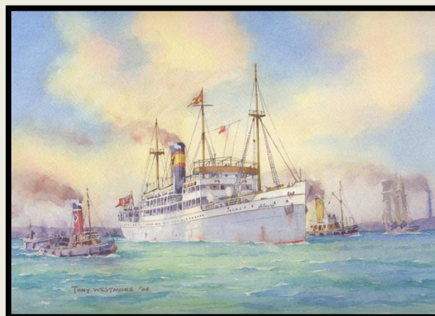
"Avoceta" inbound on the Mersey circa 1930s