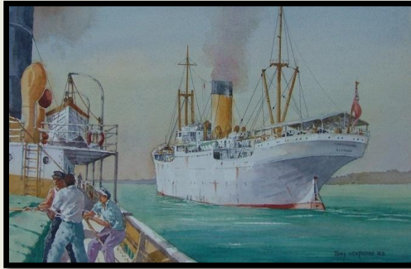
Elders & Fyffes "Tortuguero" Homeward Bound circa 1950s