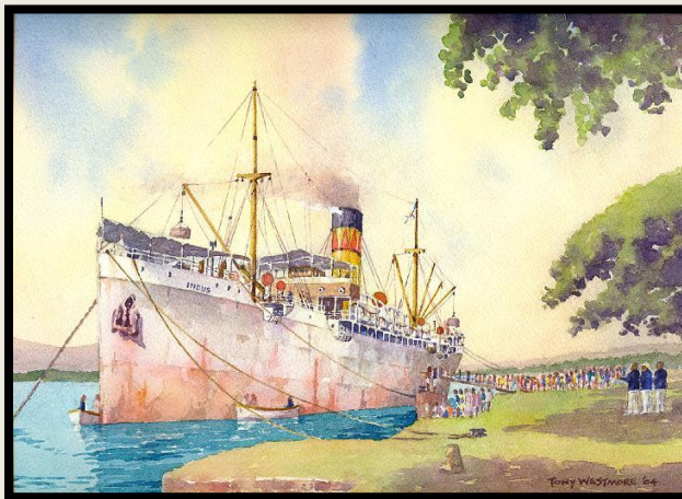
Nourse Steamship Line's "Indus" at Guardaloupe circa 1930s