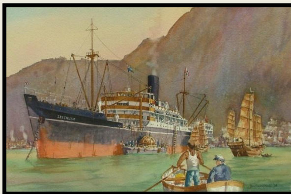
C.N. Co’s “Szechuen” at Hong Kong in the 1950s