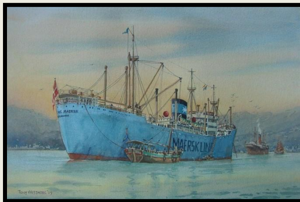
“Nicoline Maersk” at Hong Kong circa 1960s