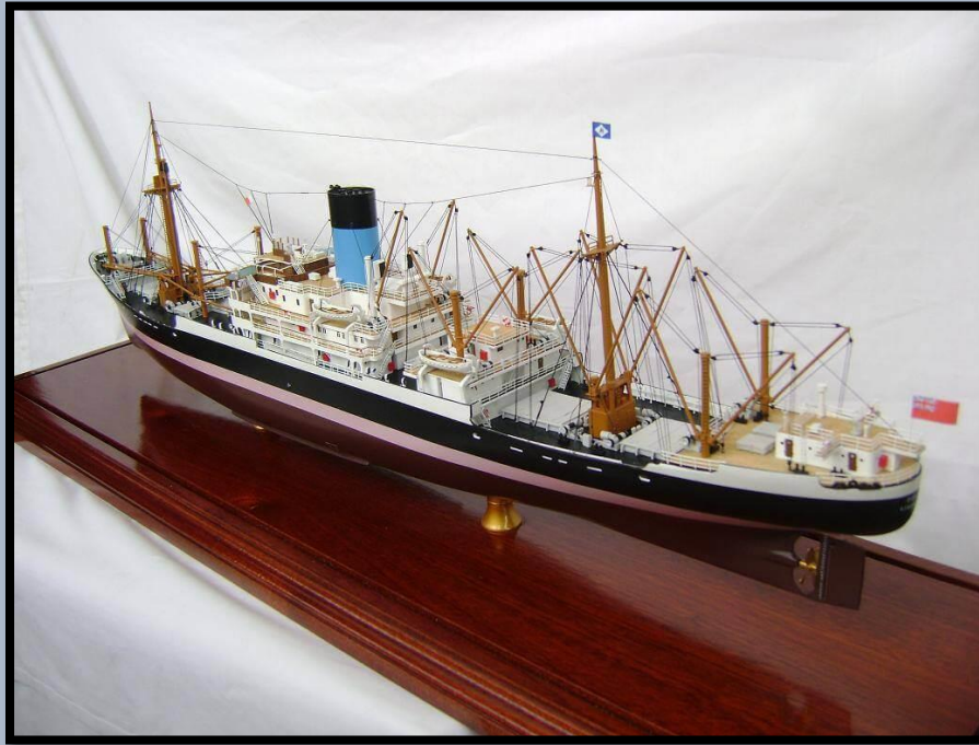
MV. Dolius 1956 - 1992 (Deleted from Register)